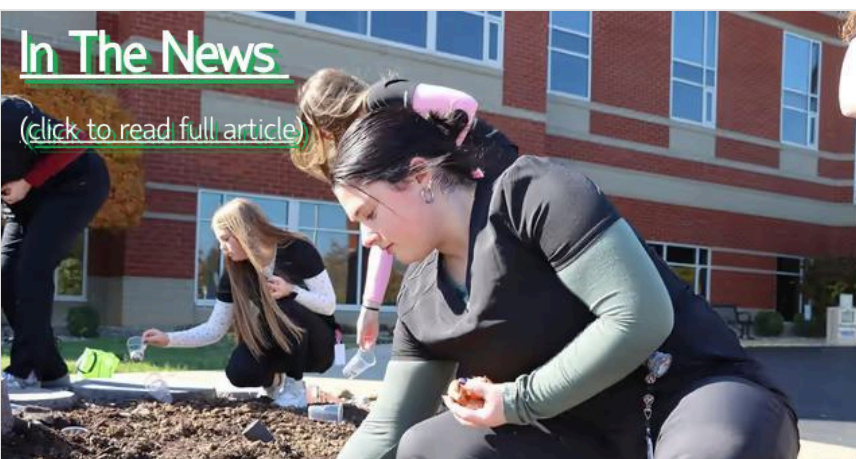
In The News (click to read full article)